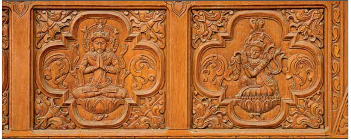
Wooden carving on the gate of Northern small pagoda