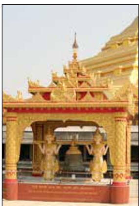
Huge bell [weighing 11 tonne ]

Goenka to place in the Global Vipassana Pagoda for the benefit of the countless faithful who come here to meditate. Another portion of the relics enshrined in the Pagoda was received from the prime minister of Sri Lanka.