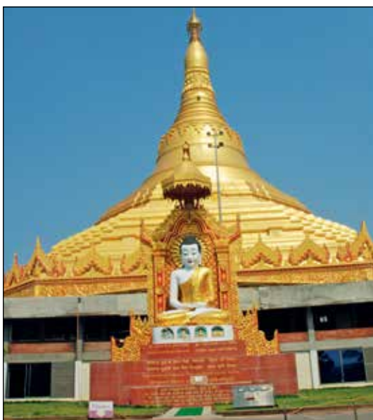
Buddha statue with Global Pagoda in background

of the middle dome and a revolving stage is created in the centre of the main dome at the ground level so that meditation can be done around it while listening to the sermons. It has the capacity of accommodating over 8,000 meditating people at a time. Meanwhile, efforts are on to improve the acoustic design of the Pagoda in such a way that the echo disturbance can be kept at its minimum.