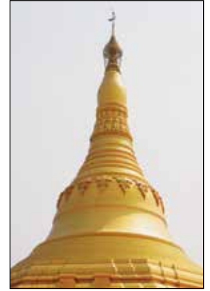
View of Global Pagoda showing circular bell shaped pointed pinnacle with crystal, steel umbrella, Dhamma Dhvaja.