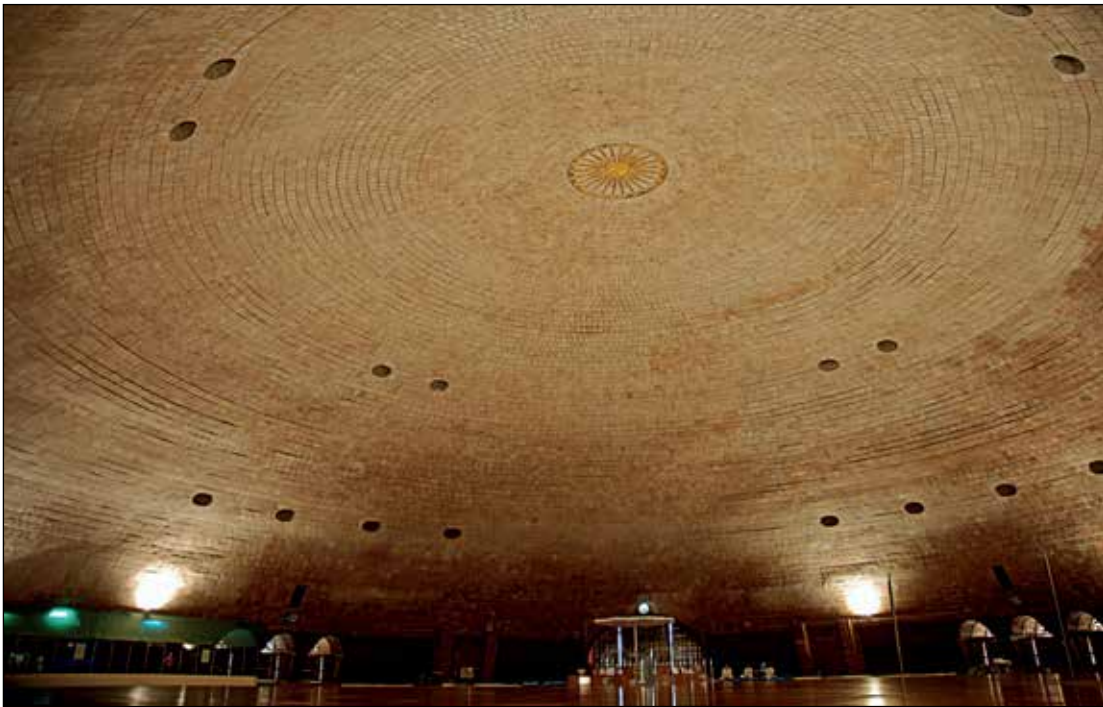
Inner view of first main dome

From the north to the south and through the west there is a two-storied C-shaped basement area housing service facilities. On the first floor of the basement one can discover many facts about Vipassana and the inspiring life and teachings of Buddha in a wonderful exhibition gallery displaying 123 paintings. There is also an audio-visual centre and a gallery of wall mounts and photographs adjacent to a book and souvenir shop. Besides these, there is a library and two auditoriums under construction. Service facilities such as rest-rooms, offices, quarters and a food court are located on the ground floor of the basement area. A three-storied guesthouse is being built outside the Pagoda premises in the northwest direction.