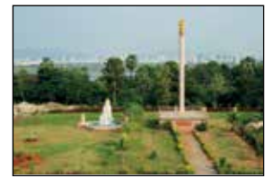
Garden, Grand Ashoka pillar & fountain on left side

The initial plan was to build the Pagoda in RCC and mild steel. But since the aim of the