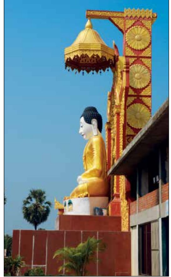
Side view of Buddha Statue

The word 'Pagoda' - meaning a Buddhist shrine - is a Portuguese mispronunciation of the word 'Dagoba'. The Sinhalese word