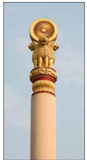
Ashoka Pillar with Lions & Dhamma Wheel [similar to Sarnath pillar]

The Global Vipassana Pagoda is a monument of peace and harmony spreading the message of Vipassana. Just as we now view with awe the ancient pyramids in Egypt, those in centuries to come will look back and wonder at the many architectural boundaries that were crossed in constructing the Global Pagoda - this monument of gratitude.