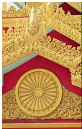
Dhamma Wheel on Burma Gate

The Global Vipassana Pagoda located in the southwest of Mumbai near Gorai beach is Asia's tallest stone structure that majestically rises in the sky against the blue background of the Arabian Sea. Surrounded by important ancient Buddhist heritage sites and close to Sopara, the ancient harbour city of Shurparak or Supparaka blessed by the holy footprints of Buddha's disciples, this Pagoda is a tribute to our glorious past and rich heritage.