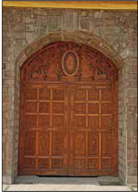
One of eight gates of Northern small Pagoda