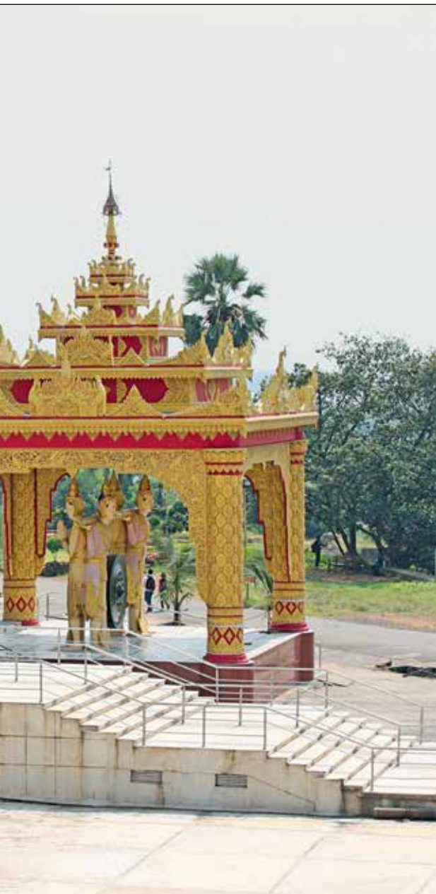
Main staircase with Gong and huge bell right & left side respectively