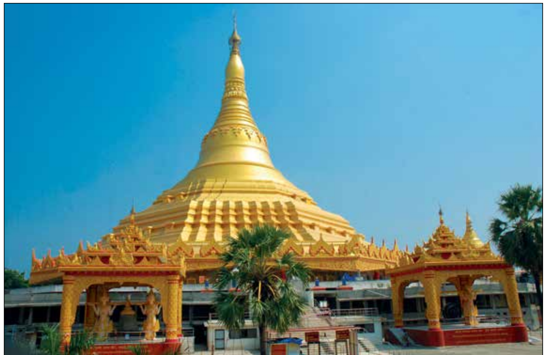
View of Global Pagoda after Burma gate